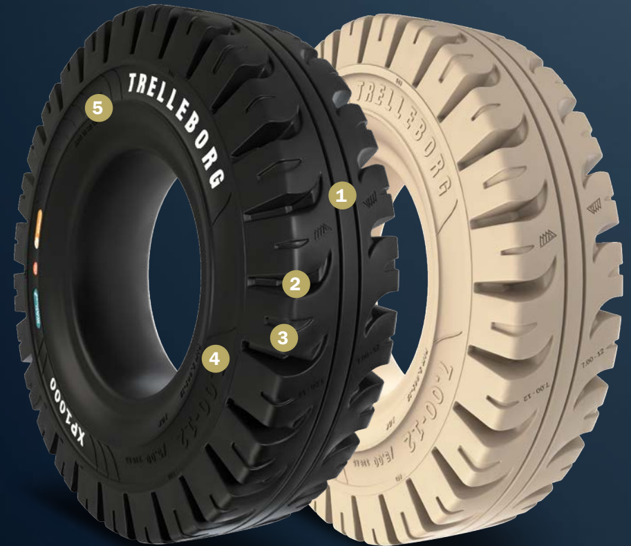
Patented pattern design